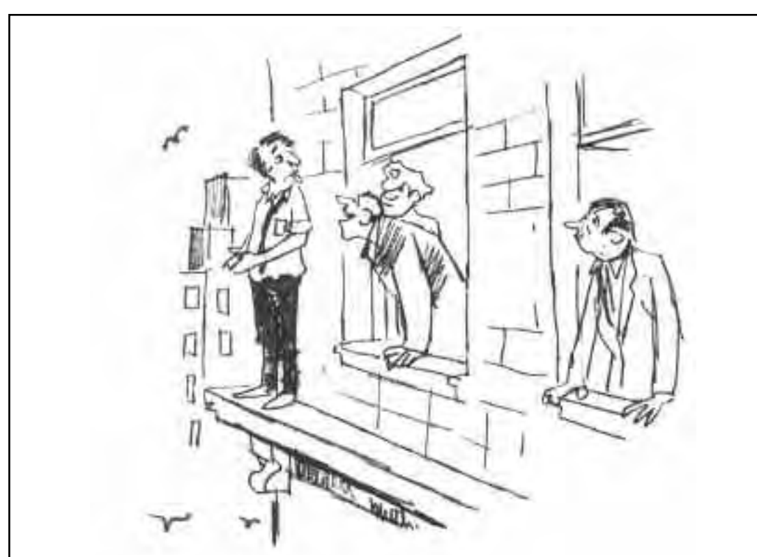
We can get you a Seventh-day Adventist they don't have an eternal hell!